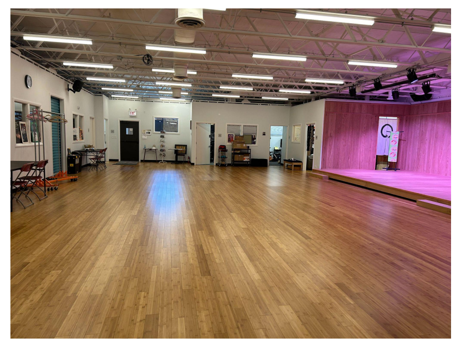
Above: open dance area with wood floor.

Above: a wall with three doors. One wheelchair accessible restroom. A second restroom. And a shower room in the middle.